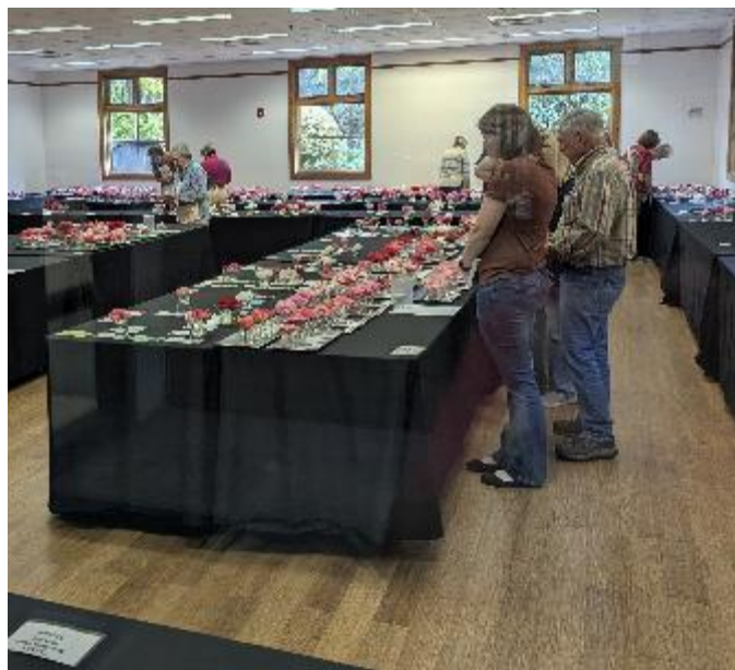
January 2026 GCS Show