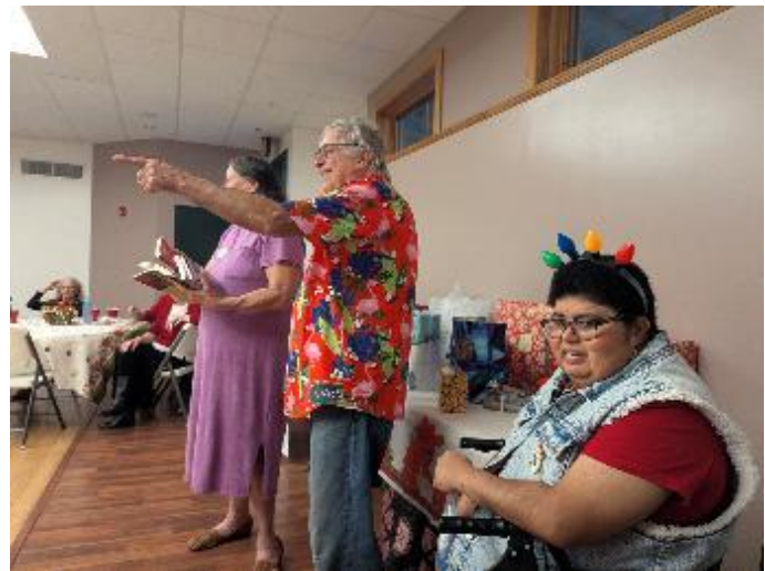
Sandy Claus & Amy Elf

Discussion then focused on logistics for the upcoming camellia plant sale and show, including scheduling, setup, and the transport of camellias from host properties. Plant Sale Committee members and volunteers will meet at Kanapaha Botanical Gardens on January 1 at 9:00 a.m. to set up the sale area and unload camellias. Gates will open at 9:00 a.m. and close promptly at 1:00 p.m. Volunteers will meet again on January 2nd at 9:00 a.m. to arrange camellias in alphabetical order. Members were encouraged to participate on both days, as additional volunteers are needed.